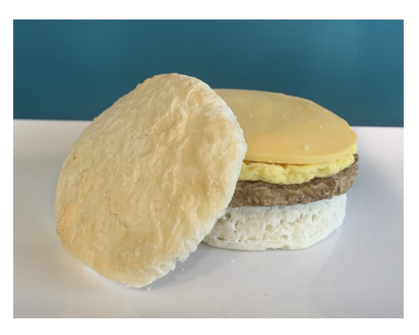
Breakfast Sandwich Filled with Sausage, Egg & Cheese $4.25