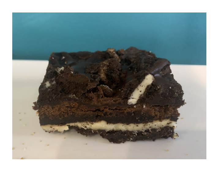
Oreo Cookie Brownie $3.25