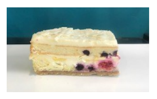
Strawberry & Lemon Stack $4.25