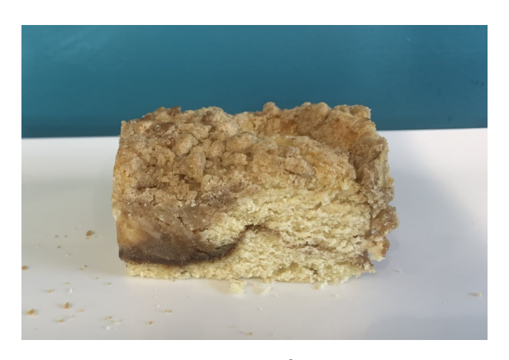
Cinnamon Coffee Cake $3.25