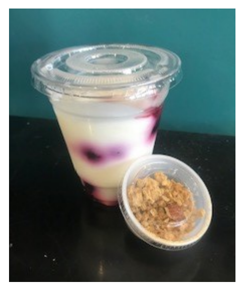
Yogurt Parfait $4.25