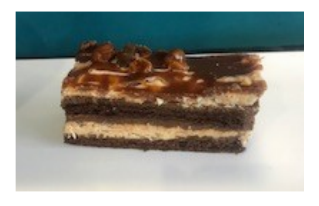
Chocolate, Peanut Butter Stack $4.25