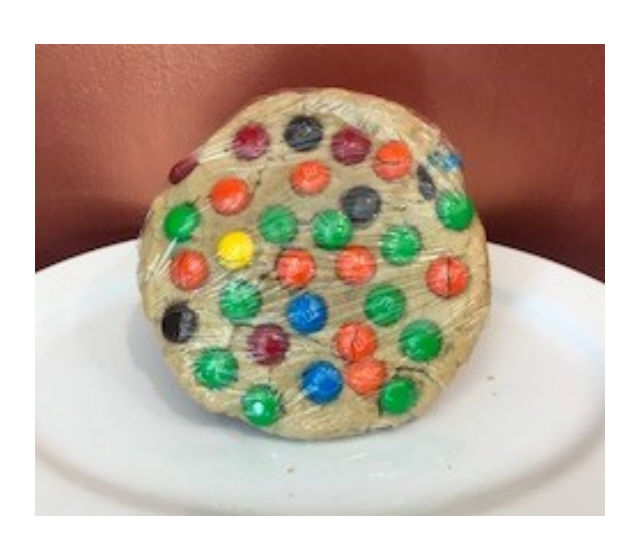
Wicked Cookie $3.29