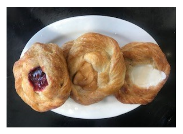
Assorted Danishes $3.25 Cheese, Apple or Cherry