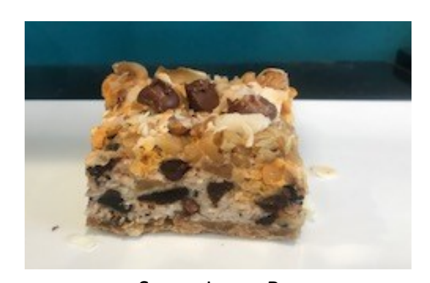
Seven Layer Bar Butterscotch, Chocolate, Coconut $4.25