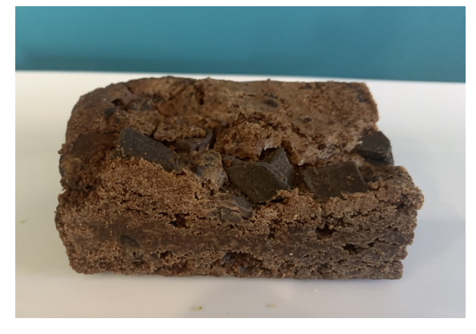
Chocolate Brownie $3.25