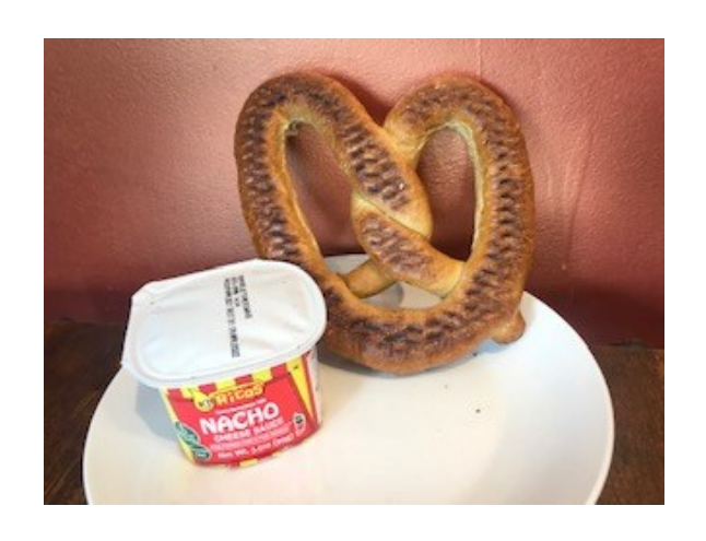
Pretzel $2.99 Add cheese sauce $0.75